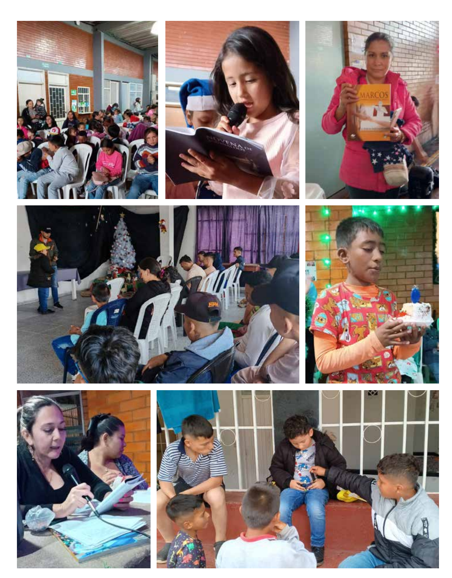
My favorite line in the Novena reads: