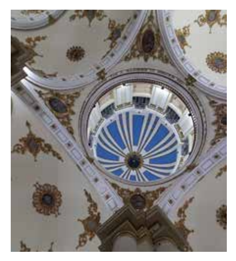
The roofing at one of the Cathedrals, there are 3 plazas and there are 3 big Cathedrals on those plazas