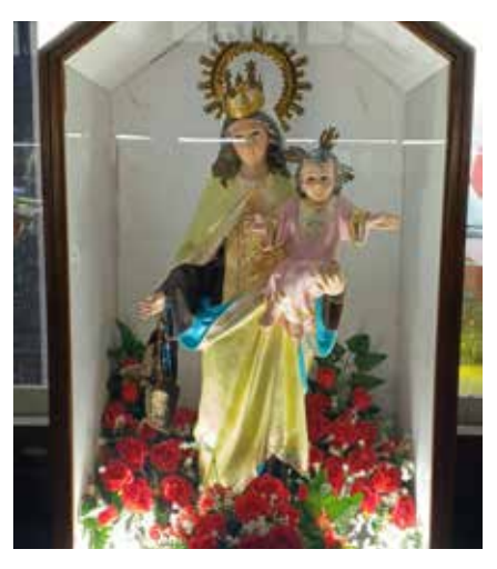
At the bus terminal